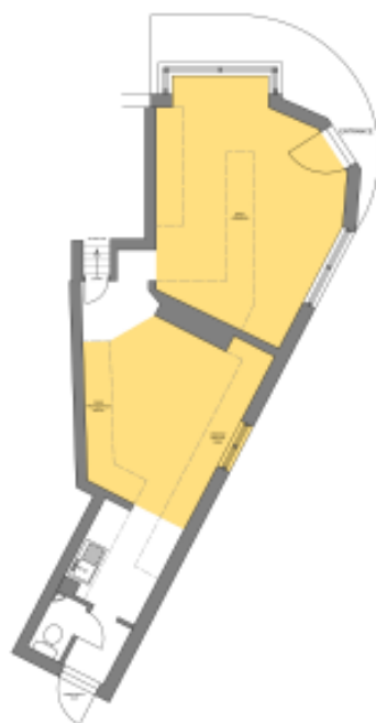
EXISTING GROUND FLOOR PLAN - 1/50